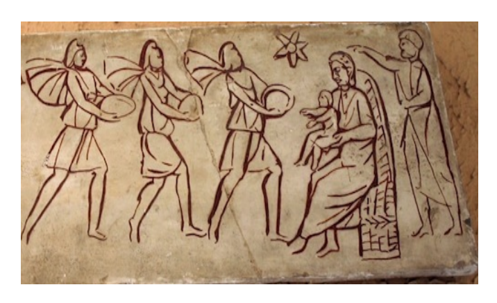
Rev 2:25-28 But that which you have already hold fast till I come. And he that overcomes, and keeps my works unto the end, to him will I give power over the nations: And he shall rule them with a rod of iron; as the vessels of a potter shall they be broken to pieces: even as I received of my Father. And I will give him the morning star.

2 Peter 1:19 And we have the word of prophecy made more sure; whereunto ye do well that ye take heed, as unto a lamp shining in a dark place, until the day dawn, and the day-star arise in your hearts: