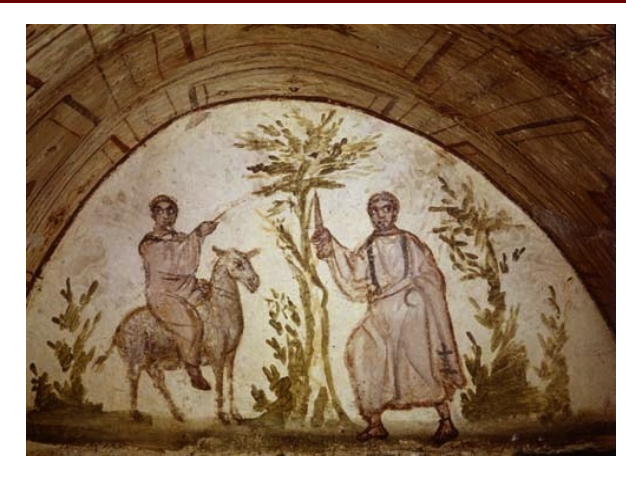
Numbers 24:17 "I see him, but not now; I behold him, but not near. A star will come out of Jacob; A scepter will rise out of Israel."

King Balak offered Balaam money to utter curses on the Jews, but he could not curse them. An angel barred Balaam's way and even his own donkey tried to stop him from cursing the Israelites. In spite of being paid to curse the Jews, Balaam could only pronounce blessings upon them (Numbers 23-24).